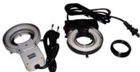
Ring fluorescent light