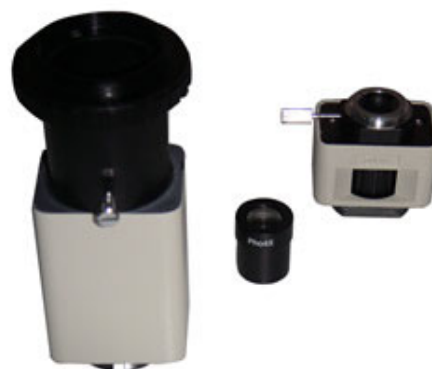
Video & Photo Attachment