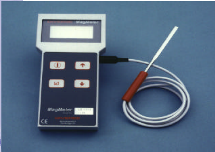
MF300H AND TRANSVERSE HALL PROBE